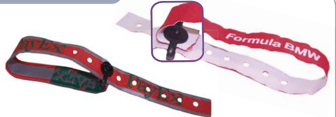
Woven fabric with plastic stud and socket